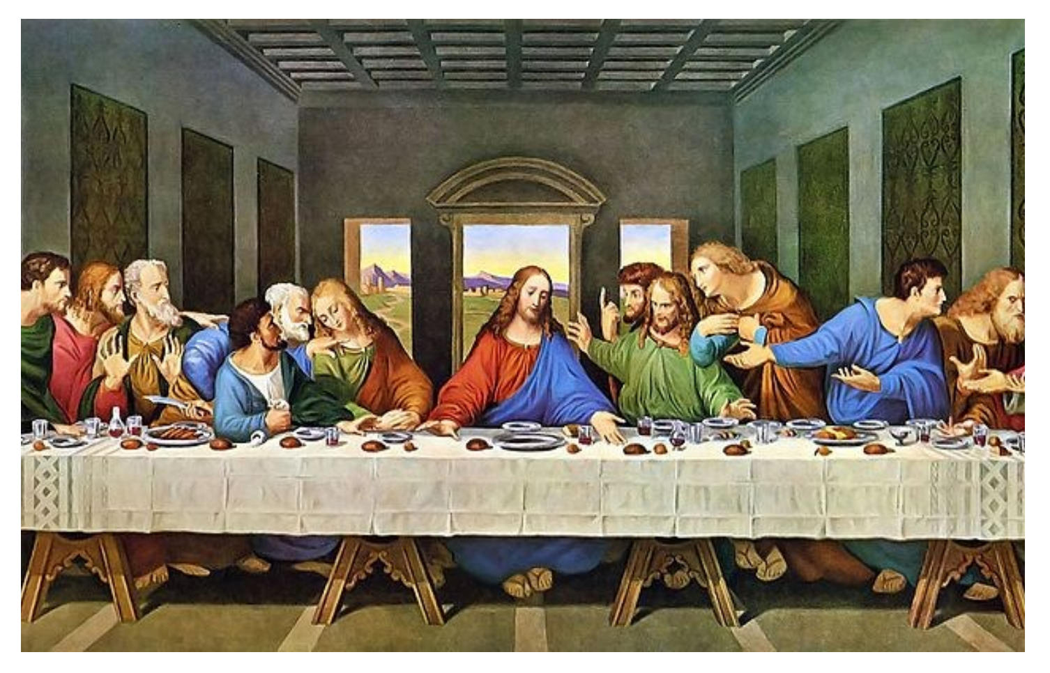
Last Supper by Leonardo Da Vinci, restored (Courtesy of Wikimedia Commons).